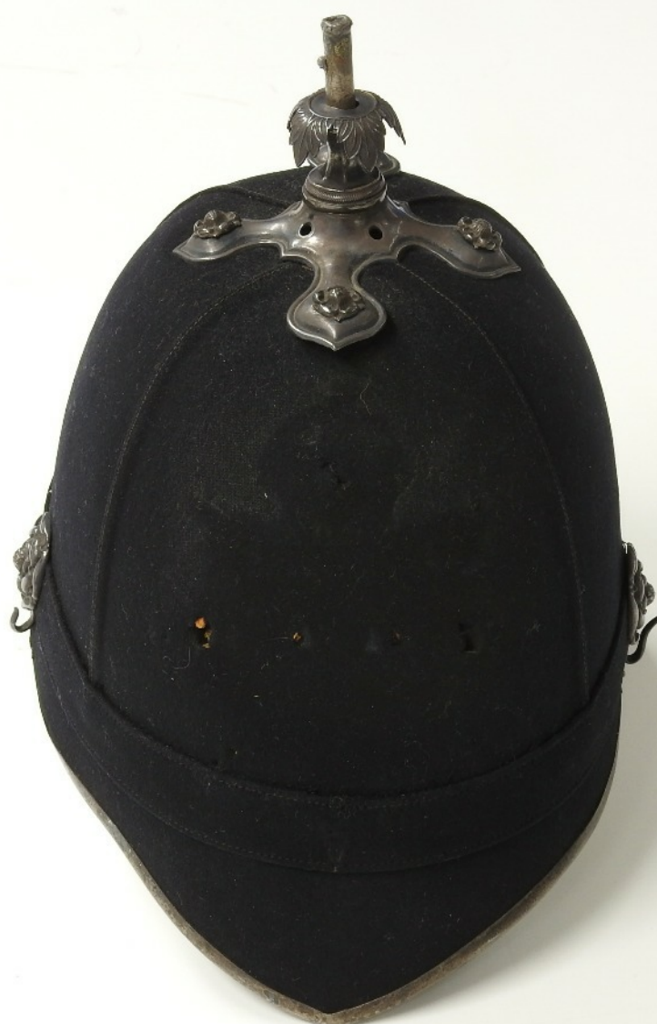
Policeman's helmet, City of Oxford

Tourism in Oxford - Oxford's booming tourist trade and the sights that entice visitors to the city.