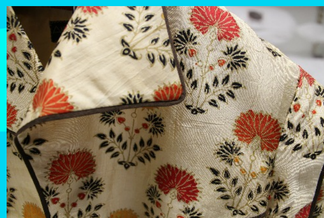
Anna Belinda Suit Jacket

Civil War - displaying objects relating to the Civil War and how this event shaped and impacted the City.