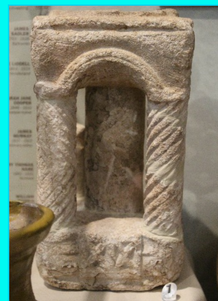
Medieval Cresset Lamp

Houses over time - a series of interactive models showing how the living room has changed from Saxon times to the modern day.